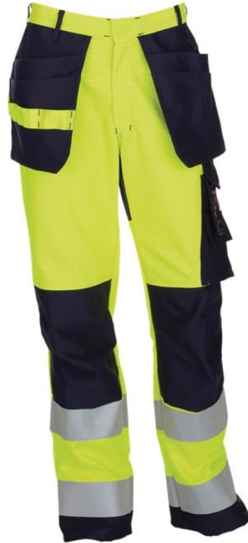
Flamtech Craftsmen Trousers