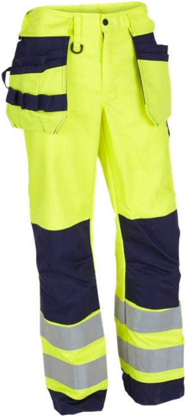
Flamtech Craftsmen Trousers