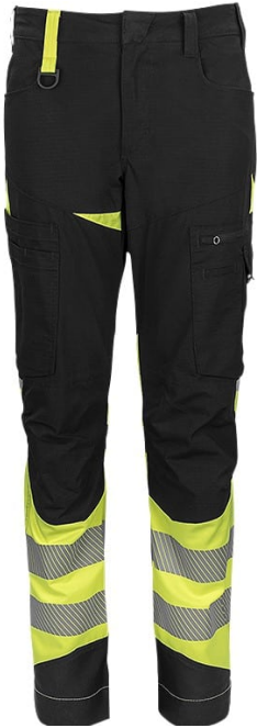
Women HiVi Pants